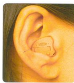
Half Shell/ Low profile